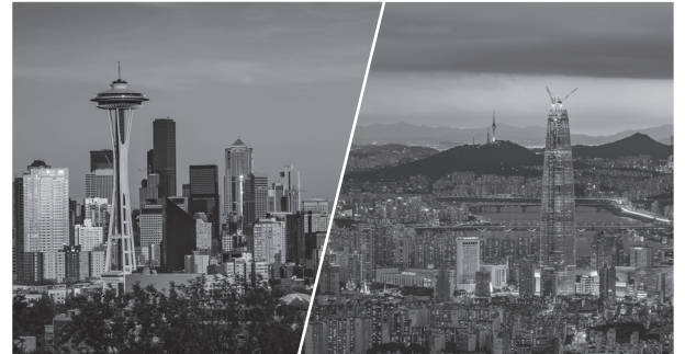
I'm from Seattle, but my grandparents live in Seoul, South Korea.