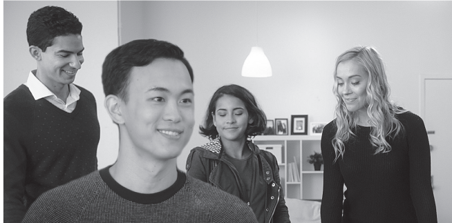
My name's Rick. I live and work in New York.

A Read about Rick and the people in his life. Then put the words in order to write questions.