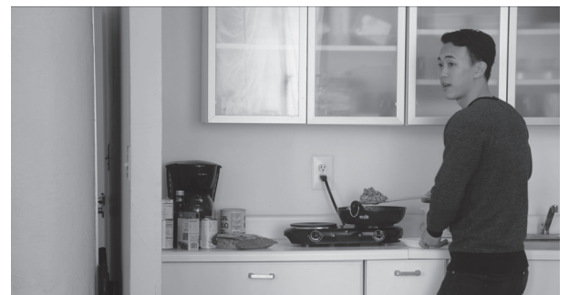
This is my favorite dish. It's vegetables and rice. I hope my friends like it!